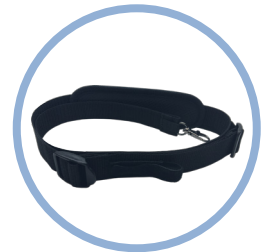
Inogen One ® G4 Carry Strap* Item # CA-401