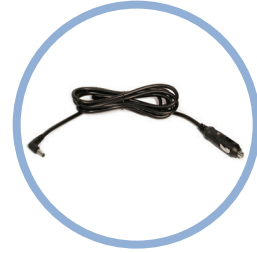
Inogen One ® G4 DC Power Cable* Item # BA-306