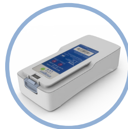
Inogen One ® G4 Extended Life Lithium Ion Battery** Up to 5 hours run time Item #BA-408