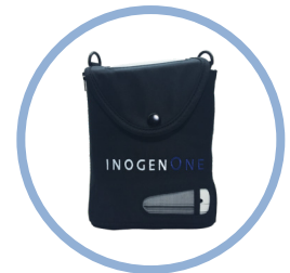
Inogen One ® G4 Carry Bag* Item # CA-400