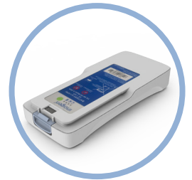
Inogen One ® G4 Lithium Ion Battery* Up to 2.7 hours run time Item #BA-400